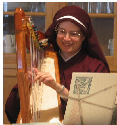
Celtic harp: gift of St. Philip Benizi Parish choirs, Jonesboro, Georgia